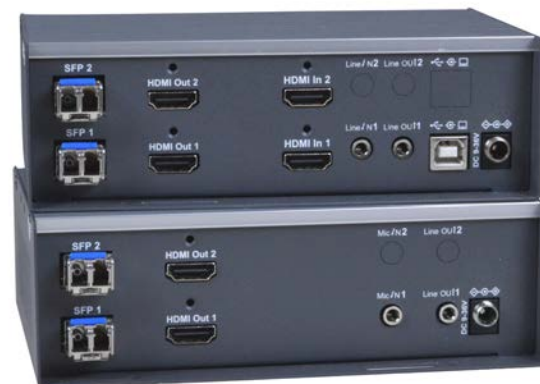
XTENDEX® STF0USB4K-LCDH (Local & Remote Units)