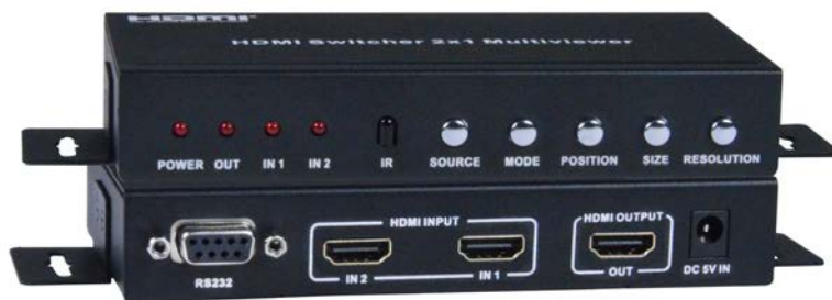
SPLITMUX-HD-2RSLC (Front & Back)