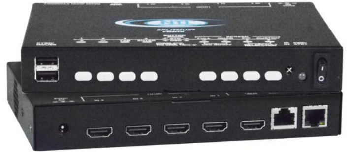
SPLITMUX-HD-4RT (Front & Back)