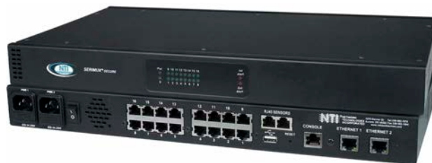
SERIMUX-S-16DP (Front & Back)