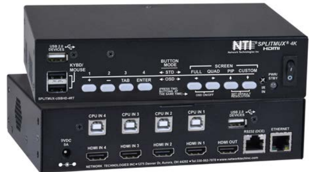
SPLITMUX-USB4K-4RT (Front & Back)