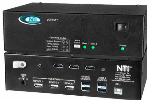
VOPEX-USBH-2 (Front & Back)

The VOPEX® HDMI/DVI USB KVM splitter with built-in USB hub allows up to four users (four USB keyboards, USB mice and DVI/HDMI monitors) to access one USB computer and up to three USB devices (printers, scanners, security cameras, etc.).